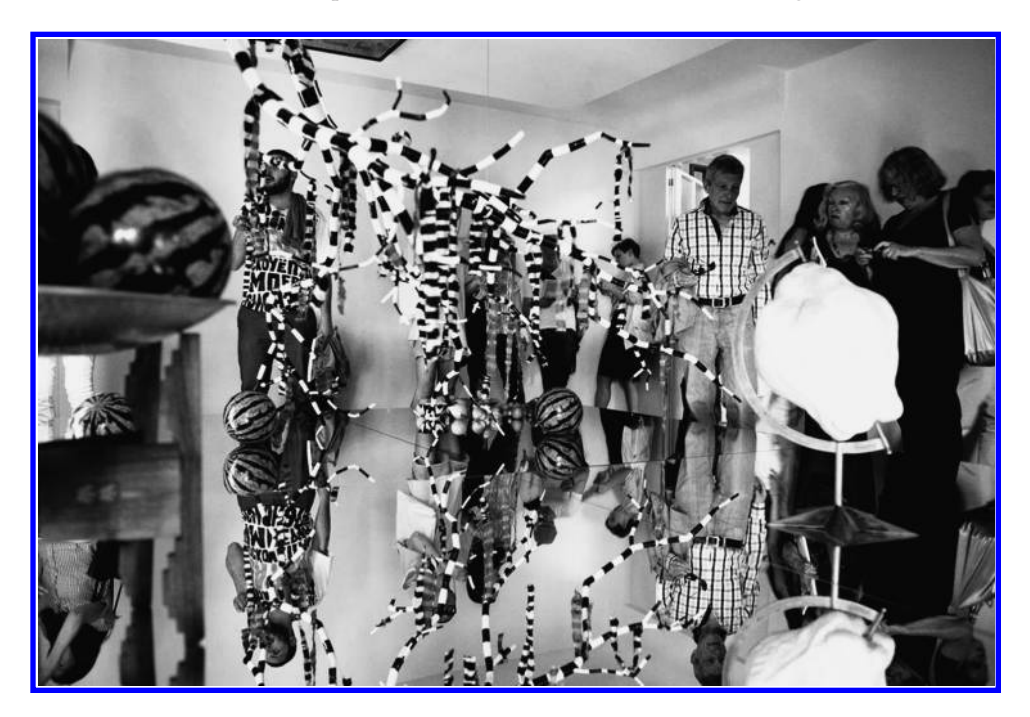
Slavs and Tatars. Not Moscow Not Mecca, installation view, Secession, Vienna, 2012.

"different registers" onto the "same page, sentence, or space" is what I have identified as the aggregator's impulse to furnish a platform where unlike things may occupy a common space. In their exhibition Not Moscow Not Mecca at the Vienna Secession in 2012, for example, the group generated an exhibition based on the trans-regional histories of fruits in Central Asia, which they wittily called The Faculty of Fruits , and which included the apricot, the mulberry, the persimmon, the watermelon, the quince, the fig, the melon, the cucumber, the pomegranate, the sour cherry, and the sweet lemon. A book was produced that documents the fascinating histories of how