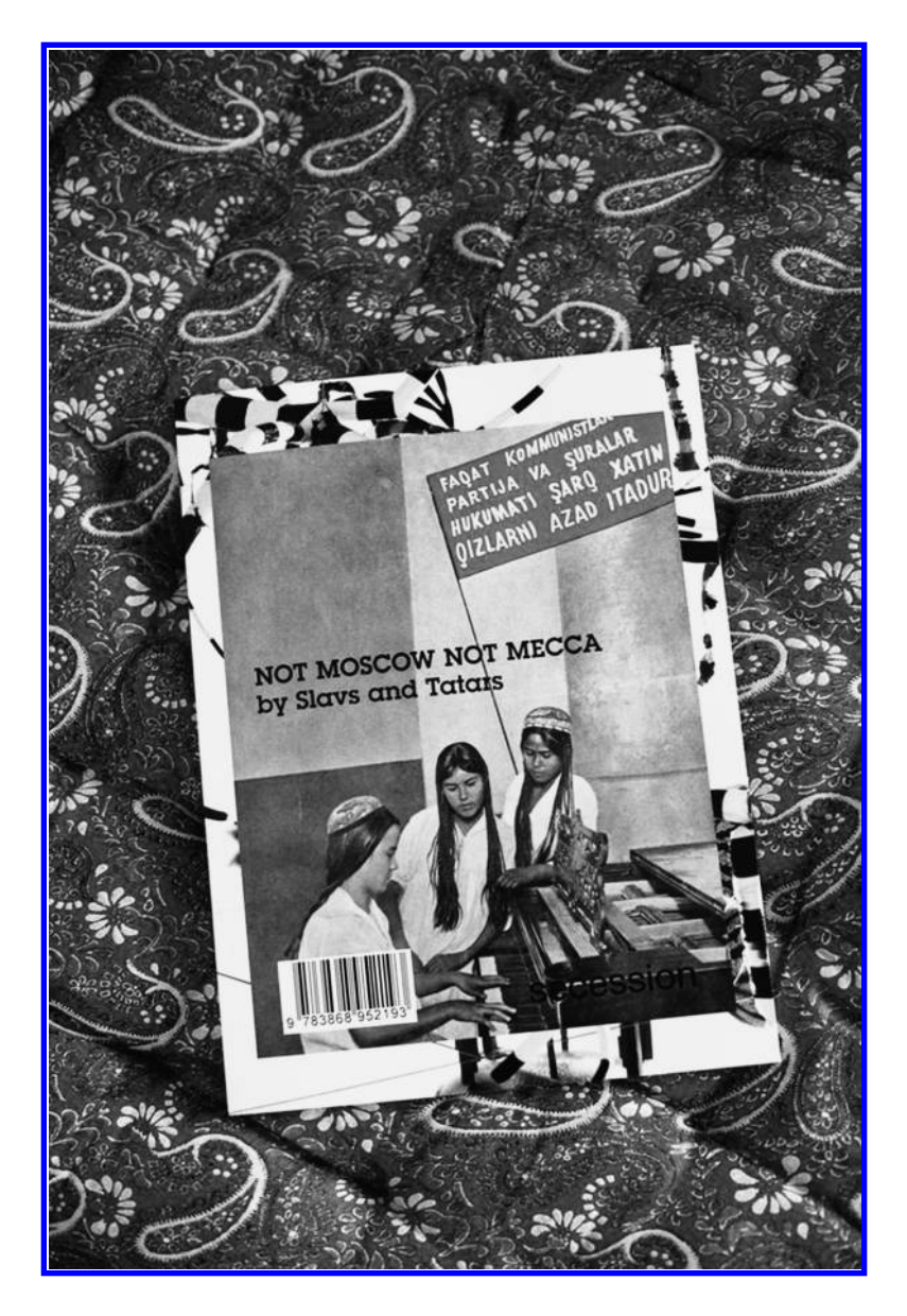
Slavs and Tatars. Not Moscow Not Mecca. 2012.