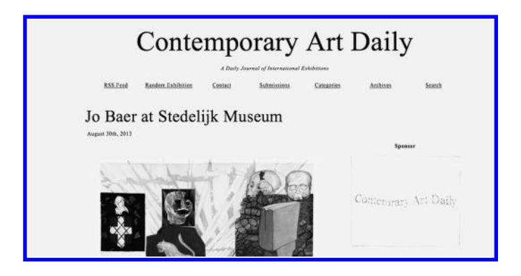
Contemporary Art Daily, accessed August 30, 2013.

"global" dialects of the present moment, however, proceed from a different syntactic model: that of the aggregator. Aggregators are online services such as Contemporary Art Daily or e-flux that filter information for art-world consumption, making it possible, as a new generation of artists and critics has begun to assert, to shape vast flows and reservoirs of art-world information through the digital template of search algorithms and screen-based visual interfaces from laptops to smart phones.<sup>15</sup>