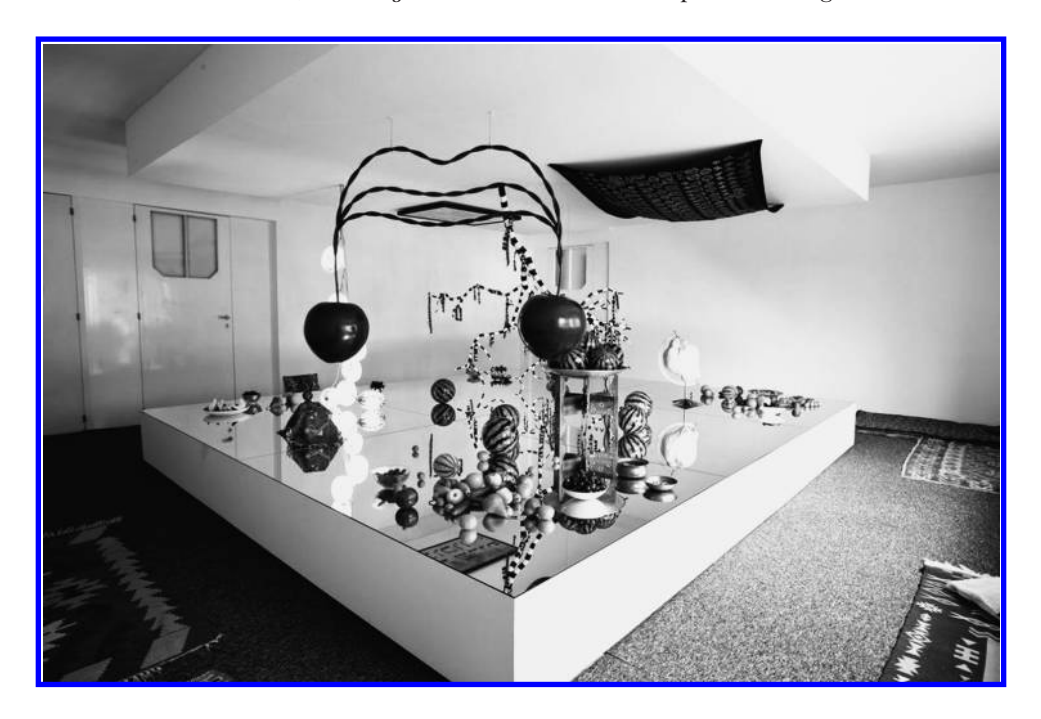
Slavs and Tatars. Not Moscow Not Mecca, installation view, Secession, Vienna, 2012.

I will adduce just one example of the logic of aggregates in practice. Slavs and Tatars is an anonymous collective whose work addresses an often overlooked geopolitical region, the area east of the Berlin Wall and west of the Great Wall of China, which witnessed one of the epic ideological contests of the twentieth century, between Islam and Communism. Through texts (transmitted in books as well as in artifacts in exhibitions) and objects, Slavs and Tatars explore, among other themes,