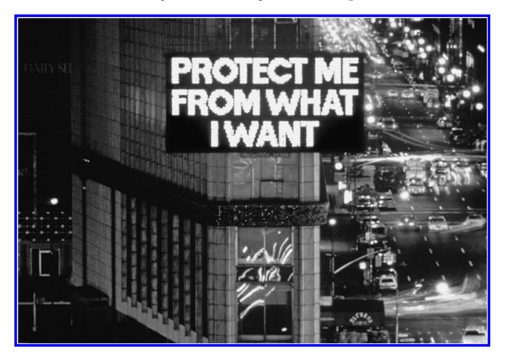
Jenny Holzer. Protect Me from What I Want. 1985.

dialects. American Conceptual works of the 1960s and '70s, for instance, tended toward the declarative, developing a rhetoric of administration that was nonetheless characterized by tautology and Kafkaesque absurdity.<sup>14</sup> The post-modern "dialect" developed from Conceptual art during the late '70s and '80s